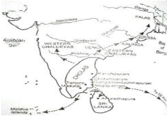
MAP 1.11 The Expansion of Cholas