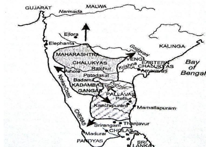
MAP 1. 10 Various Kingdoms Ruling south India

Rajasimha Maravarma (AD 900 -920); Maravarma Sundra Pandya (AD 1226-1238); Jatavarma Sundra Pandya (1251 to 1268 AD) and Kulasekhra (AD 1281-1311). The last known Pandya king, parakramadeva, was defeated by Usuf Khan (a Victory of Muhammad-bin-Tughlaq) when the Tughlaq Dynasty was in the process of extending their kingdom upto Kanyakumari.